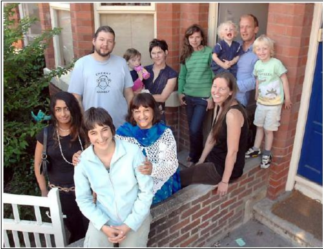
Photo: The families who received clean-burning wood stoves and solar hot water systems under the award-winning Old Trafford Renewables Project.

A strategy for the transition to a low-carbon future in Trafford